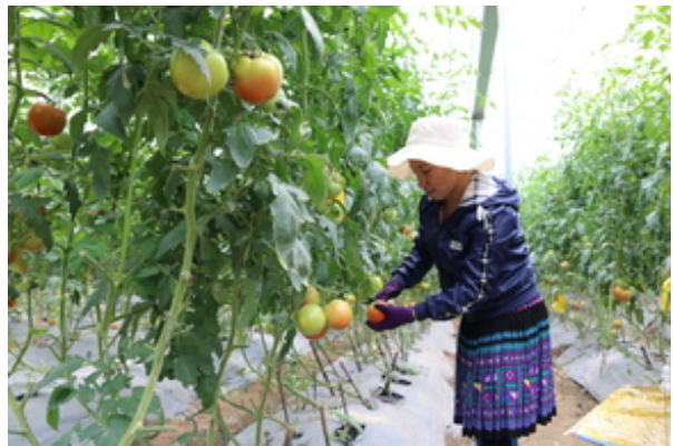
Mong woman working with Greenfarm's VietGAP Vegetables project in Moc Chau District, Son La Province