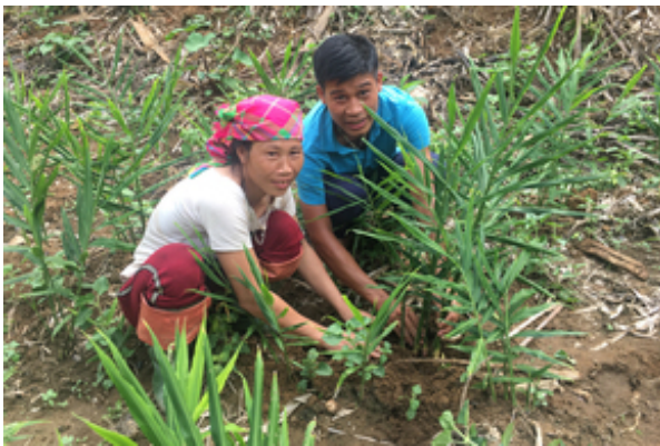
Tay ethnic female ginger grower in Van Ban District, Lao Cai Province receiving technical support from Duc Phu District, Son La Province Company