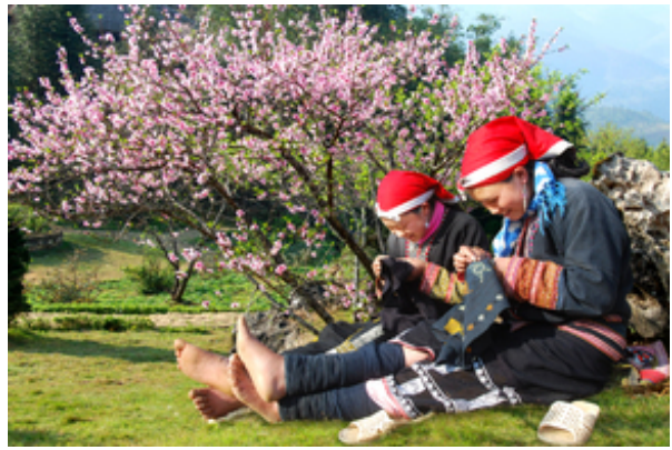
Red Dao women, Culture and Information Department's Community Based Tourism project in Sapa District, Lao Cai Province