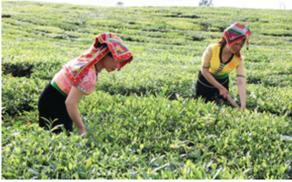
Thai ethnic tea growers, Vina Tea Company's Green Technology Tea project in Moc Chau District, Son La Province